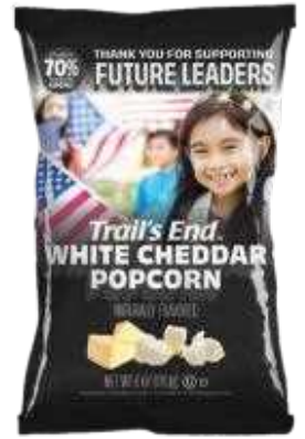
$20 White Cheddar