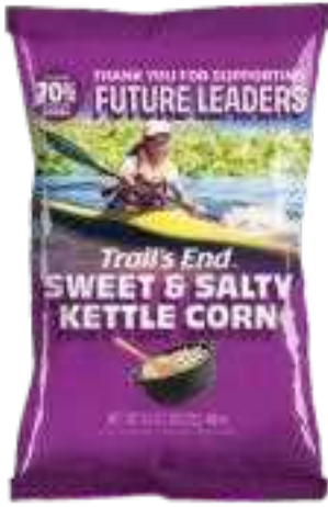
$15 Sweet & Salty Kettle Corn