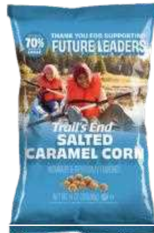
$25 Salted Caramel