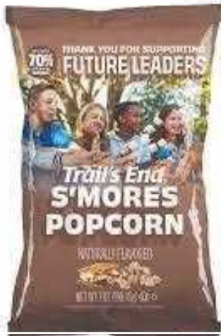
$25 S'mores Popcorn