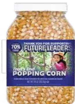
$20 Popping Corn