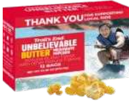
$25 Unbelievable Butter Microwave